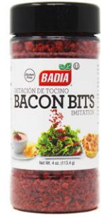
BACON BITS IMITATION - 60412 6/4 OZ