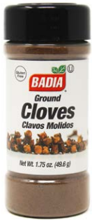
CLOVES GROUND - 80221 8/1.75 OZ