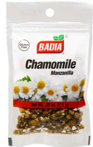
CHAMOMILE - 00034 12/0.25 OZ