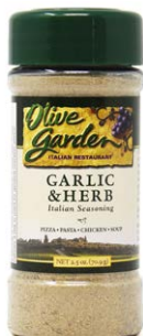
OLIVE GARDEN GARLIC & HERB ITALIAN SEASONING - 00147 12/2.5 OZ