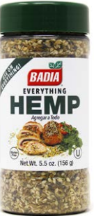
EVERYTHING HEMP - 60751 6/5.5 OZ