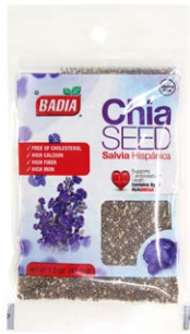
CHIA SEED - 00045 12/1.5 OZ