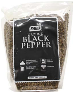
BLACK PEPPER GROUND - 02015 8/2 LBS