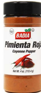
CAYENNE PEPPER - 63006

The one that started it all. The perfect combination of ingredients and spices, carefully chosen to enhance the natural flavor of your favorite food.