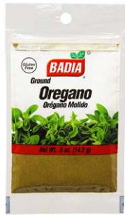
OREGANO GROUND - 00022 12/0.5 OZ