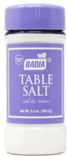
TABLE SALT - 80144 8/5.5 OZ