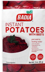
INSTANT POTATOES WITH BEETS - 01263 6/3 OZ