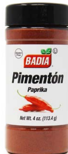
PAPRIKA - 63005