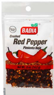
PEPPER RED CRUSHED - 00039 12/0.5 OZ