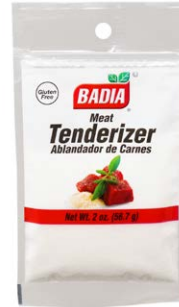
MEAT TENDERIZER - 00071 12/2 OZ