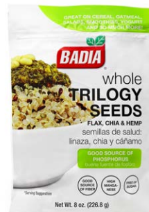
TRILOGY HEALTH SEEDS - 01210 8/8 OZ