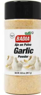
GARLIC POWDER - 00001 12/10.5 OZ