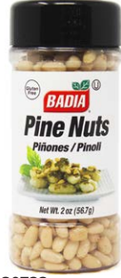
PINE NUTS - 80733 8/2 OZ