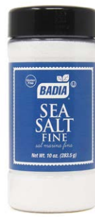
SEA SALT FINE - 60432 6/10 OZ