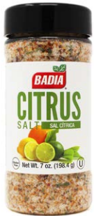
CITRUS SALT - 60184 6/7 OZ