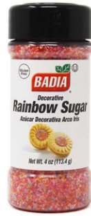
DECORATIVE RAINBOW SUGAR - 80269 8/4 OZ