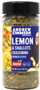
LEMON & SHALLOTS SEASONING FRENCH STYLE - 61302

Transform your everyday cooking with these all-purpose blends that capture the essence of Chef Andrew's favorite cuisines around the world.