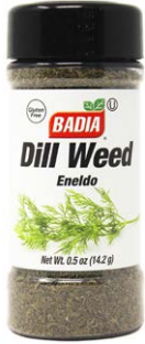
DILL WEED - 80678 8/0.5 OZ