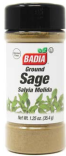
SAGE GROUND - 80675 8/1.25 OZ