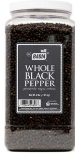
PEPPER BLACK - 00808 4/4 LBS