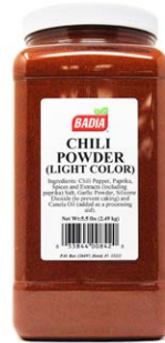
CHILI POWDER LIGHT COLOR - 00842 4/5.5 LBS