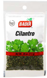
CILANTRO - 00061 12/0.25 OZ