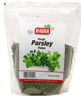
PARSLEY FLAKES - 02122 6/3 OZ