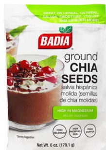
CHIA SEEDS GROUND - 01223 8/6 OZ