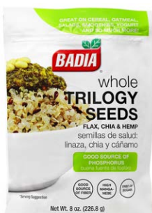
TRILOGY HEALTH SEEDS - 01210 8/8 OZ