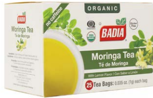
ORGANIC MORINGA TEA WITH LEMON FLAVOR - 00239 10/25 BAGS