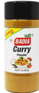
CURRY POWDER - 00212 12/7 OZ