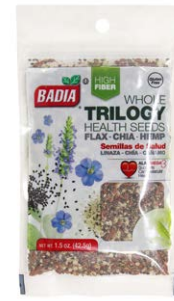
TRILOGY HEALTH SEEDS - 00080 12/1.5 OZ