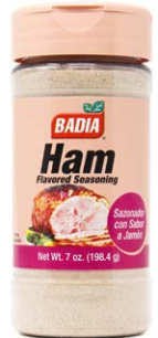
HAM FLAVORED SEASONING - 60139 6/7 OZ