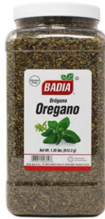
OREGANO - 00312 4/1.35 LBS