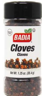
CLOVES - 80218 8/1.25 OZ