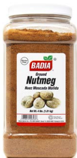
NUTMEG GROUND - 00303 4/4 LBS