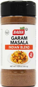
GARAM MASALA INDIAN BLEND - 60743 6/4.25 OZ