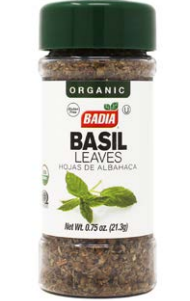
ORGANIC BASIL LEAVES - 80162 8/0.75 OZ