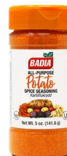
POTATO SPICE SEASONING KARTOFLUKRYDD - 60110