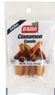
CINNAMON STICKS - 00029 12/0.5 OZ