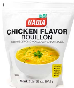
CHICKEN FLAVOR BOUILLON - 00092 8/2 LBS