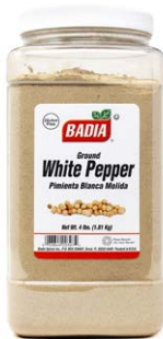
PEPPER WHITE GROUND - 00307 4/4 LBS