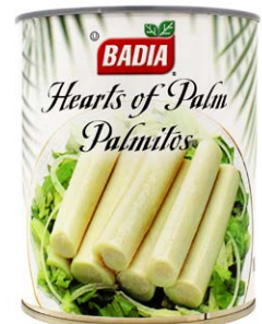
HEARTS OF PALM - 00450 12/28 OZ