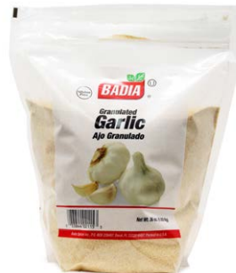
GARLIC GRANULATED - 02115 6/36 OZ