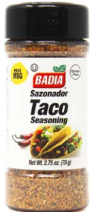
TACO SEASONING - 80263 8/2.75 OZ