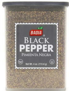
BLACK PEPPER CAN - 00407 12/4 OZ

Conveniently spice up your favorite dishes with our cans & grinders!