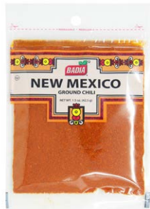
NEW MEXICO CHILI GROUND - 00648 12/1.5 OZ