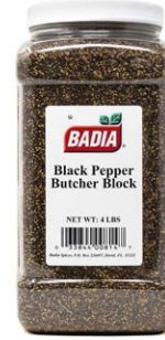
PEPPER BLACK BUTCHER BLOCK - 00814 4/4 LBS