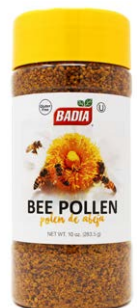
BEE POLLEN - 60125 6/10 OZ