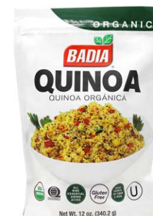
ORGANIC QUINOA - 00175 6/12 OZ