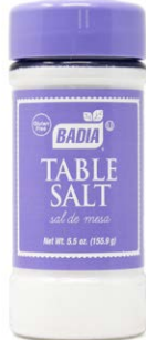
TABLE SALT - 80144 8/5.5 OZ