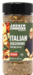
ITALIAN SEASONING TUSCAN STYLE - 61305