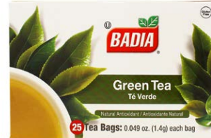
GREEN TEA - 00638 10/25 BAGS