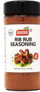
RIB RUB SEASONING - 60195 6/5.5 OZ