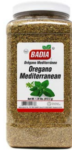
OREGANO MEDITERRANEAN - 02073 4/1.35 LBS