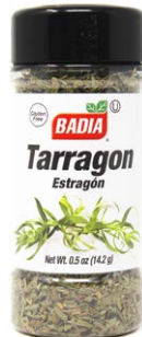
TARRAGON - 80677 8/0.5 OZ