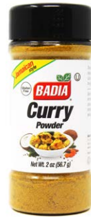
CURRY POWDER - 80200 8/2 OZ