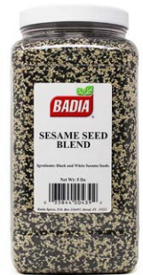
SESAME SEEDS 50/50 MIX HULLED & BLACK - 00439 4/5 LBS