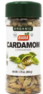
ORGANIC CARDAMOM - 80252 8/1.75 OZ