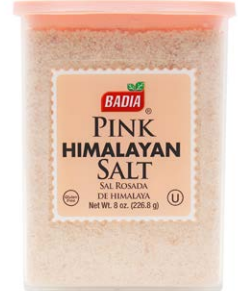
PINK HIMALAYAN SALT CAN - 00399 12/8 OZ