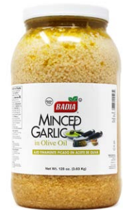
MINCED GARLIC IN OLIVE OIL - 00423 4/128 OZ