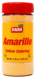
YELLOW COLORING - 60406 6/4.25 OZ