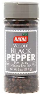
PEPPER BLACK - 80226 8/2 OZ