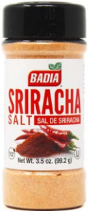
SRIRACHA SALT - 01246 12/3.5 OZ

From Sea Salt, Kosher, to Pink and our incredible Specialty Salts!