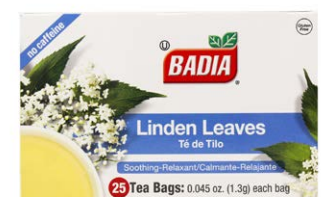
LINDEN LEAVES TEA - 00791 10/25 BAGS