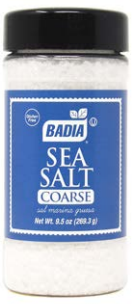
SEA SALT COARSE - 60434 6/9.5 OZ