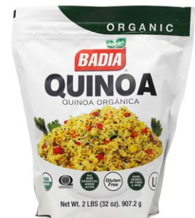
ORGANIC QUINOA - 00094 6/2 LBS