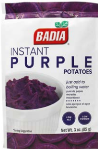
INSTANT PURPLE POTATOES - 01265 6/3 OZ