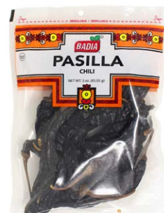
PASILLA (NEGRO LARGO) CHILI - 00066 12/3 OZ