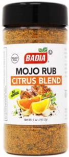
MOJO RUB CITRUS BLEND - 60145 6/5 OZ