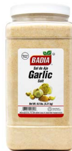
GARLIC SALT - 00801 4/9.5 LBS