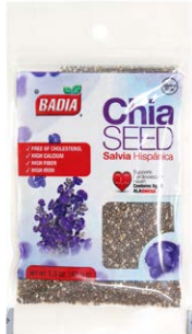
CHIA SEED - 00045 12/1.5 OZ