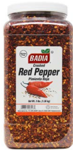
PEPPER RED CRUSHED - 00317 4/4 LBS