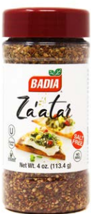
ZA'ATAR - 60090 6/4 OZ