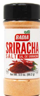
SRIRACHA SALT - 01246 12/3.5 OZ