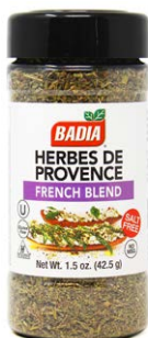
HERBES DE PROVENCE FRENCH BLEND - 60741 6/1.5 OZ