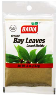
BAY LEAVES GROUND - 00020 12/0.5 OZ