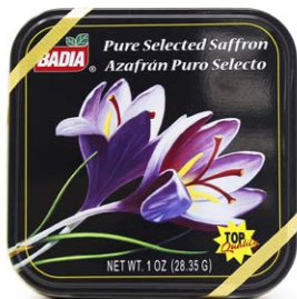
PURE SELECTED SAFFRON CAN - 00769 1/1 OZ