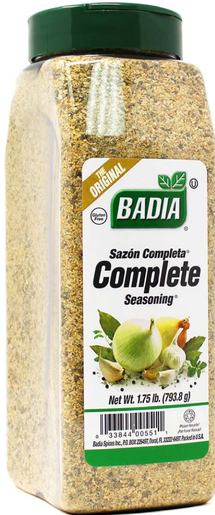
COMPLETE SEASONING® - 00551 6/1.75 LBS

These jars are filled with the ideal amount to enjoy our favorites, from basics in the kitchen to our proprietary blends.