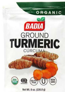
ORGANIC TURMERIC GROUND - 02129 8/8 OZ