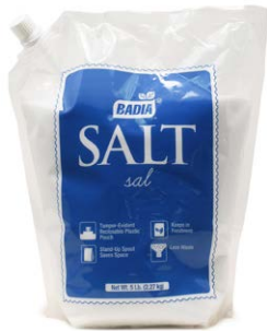
SALT - 00521 8/5 LBS