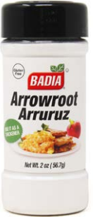
ARROWROOT - 80274 8/2 OZ