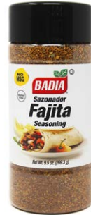
FAJITA SEASONING - 00633 12/9.5 OZ