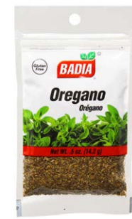
OREGANO - 00021 12/0.5 OZ