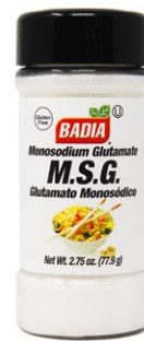
MONOSODIUM GLUTAMATE - 80230 8/2.75 OZ