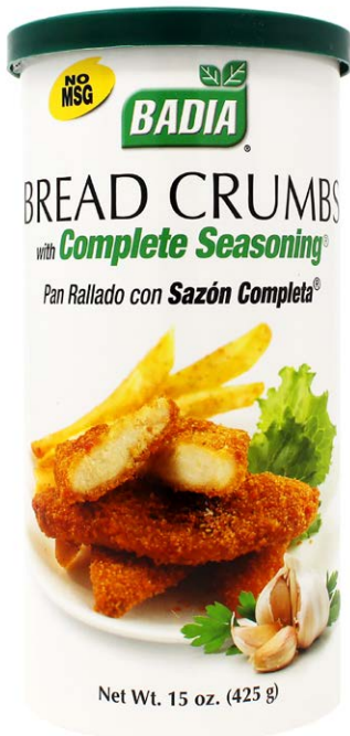
BREAD CRUMBS WITH COMPLETE SEASONING® - 00270 12/15 OZ

A fine selection of key products to create delightful dishes for every occasion.