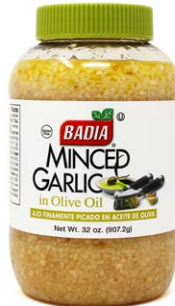
MINCED GARLIC IN OLIVE OIL - 00421 6/32 OZ