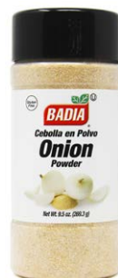
ONION POWDER - 00003 12/9.5 OZ