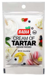
CREAM OF TARTAR - 00088 12/1.5 OZ