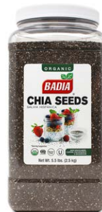
ORGANIC CHIA SEED - 20519 2/5.5 LBS