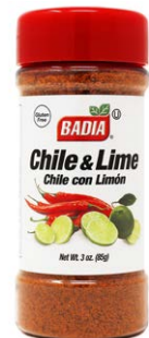
CHILE & LIME - 80154 8/3 OZ