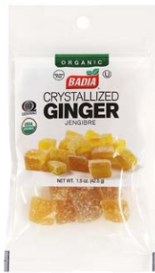
ORGANIC CRYSTALLIZED GINGER - 00083 12/1.5 OZ