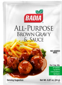
BROWN GRAVY - 00091 COMING SOON