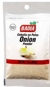
ONION POWDER - 00073 12/1 OZ