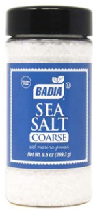
SEA SALT COARSE - 60434 6/9.5 OZ