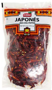
JAPONÉS (RED CHILI PEPPER) CHILI - 00681 12/6 OZ