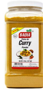
CURRY POWDER - 00602 4/4 LBS