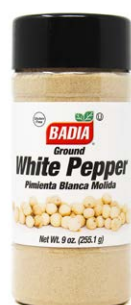
PEPPER GROUND WHITE - 00112 12/9 OZ