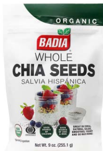
ORGANIC CHIA SEEDS - 01211 8/9 OZ