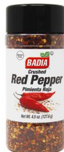
PEPPER CRUSHED RED - 00107 12/4.5 OZ