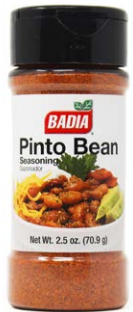
PINTO BEAN SEASONING - 80133 8/2.5 OZ