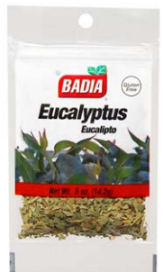
EUCALYPTUS - 00062 12/0.5 OZ