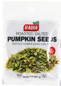
ROASTED SALTED PUMPKIN SEEDS - 00738 12/2 OZ