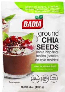
CHIA SEEDS GROUND - 01223 8/6 OZ