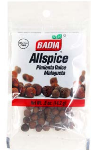
ALLSPICE - 00040

The one that started it all. The perfect combination of ingredients and spices, carefully chosen to enhance the natural flavor of your favorite food.