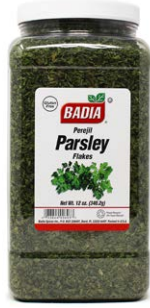
PARSLEY FLAKES - 00603 4/12 OZ