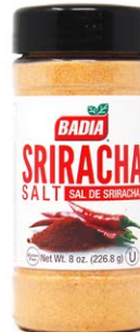
SRIRACHA SALT - 60151 6/8 OZ