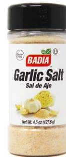
GARLIC SALT - 80004 8/4.5 OZ