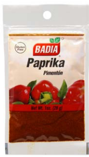
PAPRIKA - 00027 12/1 OZ