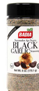
BLACK GARLIC SEASONING - 60653 6/6 OZ