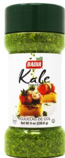
KALE FLAKES - 00185 12/8 OZ