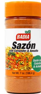
SAZÓN WITH CORIANDER & ANNATTO - 60136 6/7 OZ