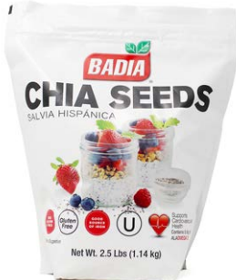
CHIA SEEDS - 02083 8/2.5 LBS