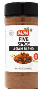
FIVE SPICE ASIAN BLEND - 60747 6/4 OZ