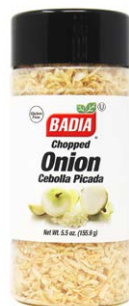
ONION CHOPPED - 00105 12/5.5 OZ