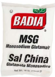
M.S.G. - 00500 6/1.75 LBS