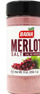
MERLOT SALT - 60155 6/9 OZ