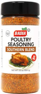
POULTRY SEASONING SOUTHERN BLEND - 60746 6/5.5 OZ