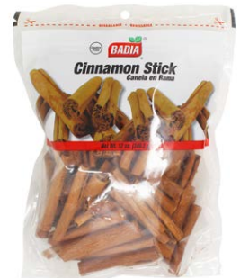
CINNAMON STICKS BAG - 60302 6/12 OZ