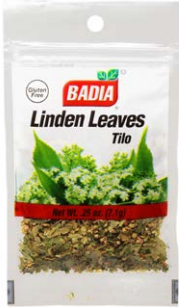
LINDEN LEAVES - 00033 12/0.25 OZ