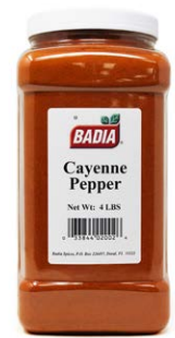
PEPPER RED CAYENNE - 02002 4/4 LBS