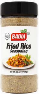
FRIED RICE SEASONING - 60198 6/6 OZ