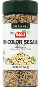
ORGANIC TRI-COLOR SESAME SEEDS - 60148 6/5 OZ