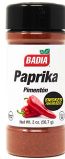
PAPRIKA SMOKED - 80213 8/2 OZ