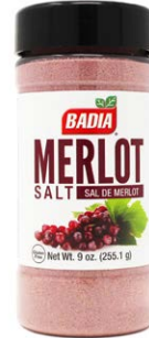
MERLOT SALT - 60155 6/9 OZ