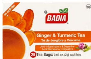
GINGER & TURMERIC TEA - 00205 10/25 BAGS