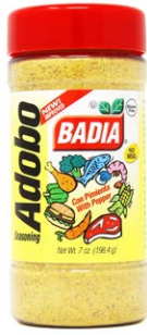
ADOBO WITH PEPPER - 60402 6/7 OZ