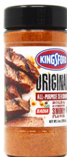
ORIGINAL ALL-PURPOSE SEASONING - 66001