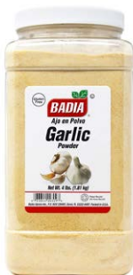
GARLIC POWDER - 00309 4/4 LBS