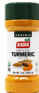
ORGANIC TURMERIC GROUND - 00115 12/7 OZ