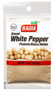
PEPPER WHITE GROUND - 00026 12/0.5 OZ