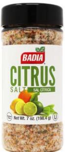
CITRUS SALT - 60184 6/7 OZ