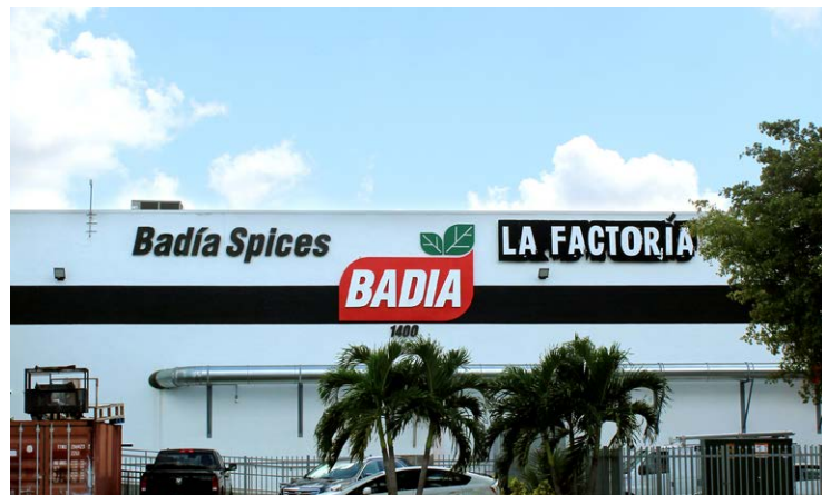
"LA FACTORIA" PRODUCTION BUILDING