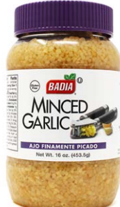
MINCED GARLIC - 00340 12/16 OZ