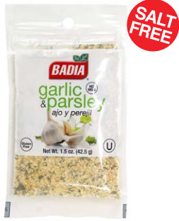
GARLIC & PARSLEY - 00076 12/1.5 OZ