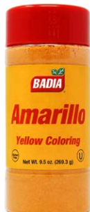
YELLOW COLORING - 00714 12/9.5 OZ