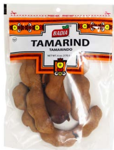
TAMARIND - 00661 12/6 OZ