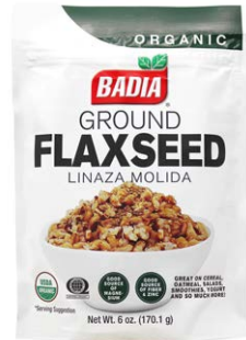
ORGANIC FLAX SEED GROUND - 01203 8/6 OZ