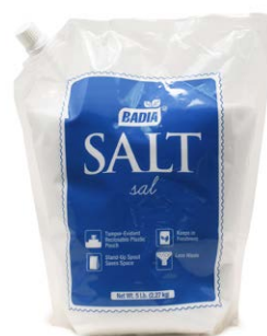
SALT - 00521 8/5 LBS