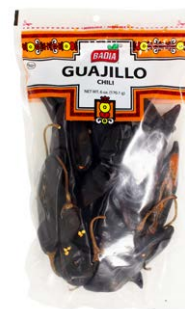
GUAJILLO CHILI - 00682 12/6 OZ