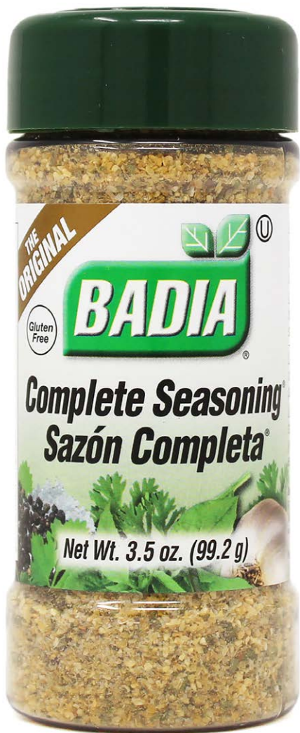
COMPLETE SEASONING® - 80008

These jars are packed with flavor! From basics for every day in the kitchen, to incredible flavorful blends.