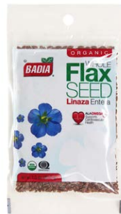
ORGANIC FLAX SEED - 00053 12/1.5 OZ