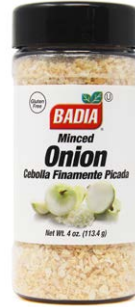
ONION MINCED - 60193 6/4 OZ