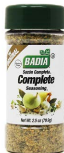
COMPLETE SEASONING® - 00128 12/2.5 OZ

The one that started it all. The perfect combination of ingredients and spices, carefully chosen to enhance the natural flavor of your favorite food.