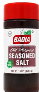
SEASONED SALT - 00623 12/16 OZ