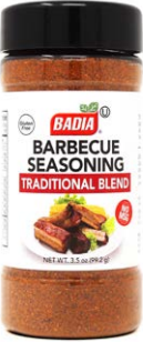
BARBECUE SEASONING TRADITIONAL BLEND - 60745 6/3.5 OZ