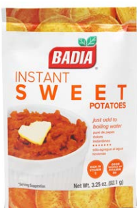
INSTANT SWEET POTATOES - 01267 6/3.25 OZ