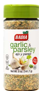
GARLIC & PARSLEY - 60403 6/5 OZ