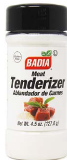
MEAT TENDERIZER - 80674 8/4.5 OZ