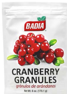
CRANBERRY GRANULES - 02127 8/6 OZ

Unique and flavorful ingredients for all your food needs!