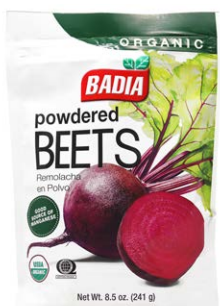
ORGANIC POWDERED BEETS - 02126 8/8.5 OZ