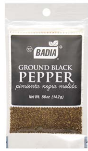
PEPPER BLACK GROUND - 00024 12/0.5 OZ