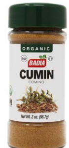
ORGANIC CUMIN GROUND - 80167 8/2 OZ