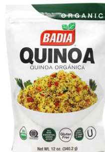
ORGANIC QUINOA - 00175 6/12 OZ