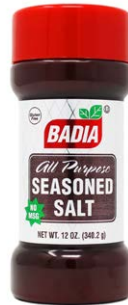
SEASONED SALT - 01202 12/12 OZ