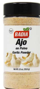
GARLIC POWDER - 63001