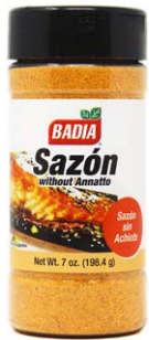
SAZÓN WITHOUT ANNATTO - 60137 6/9 OZ