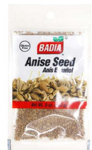
ANISE SEED - 00028