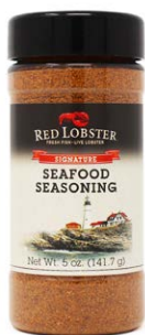
RED LOBSTER SEAFOOD SEASONING - 60290 6/5 OZ