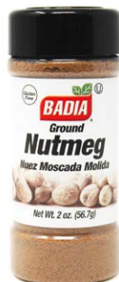
NUTMEG GROUND - 80217 8/2 OZ