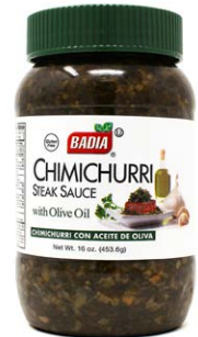
CHIMICHURRI SAUCE - 00936 12/16 OZ