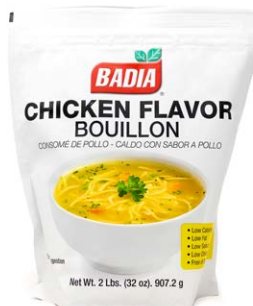
CHICKEN FLAVOR BOUILLON - 00092 8/2 LBS