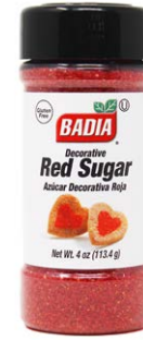
DECORATIVE RED SUGAR - 80268 8/4 OZ