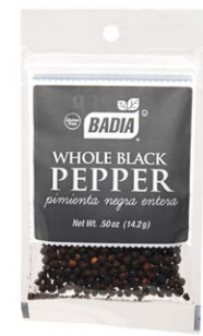
PEPPER BLACK - 00025 12/0.5 OZ