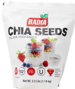
CHIA SEEDS - 02083 8/2.5 LBS