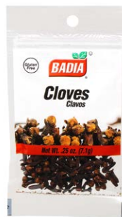
CLOVES - 00037 12/0.25 OZ