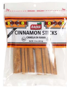
CINNAMON STICKS - 00690 12/1.5 OZ