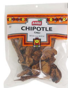
CHIPOTLE CHILI - 00703 12/3 OZ