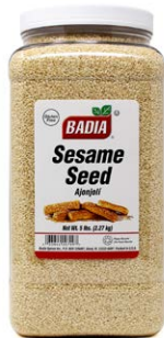
SESAME SEEDS (HULLED) - 00799 4/5 LBS