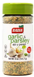
GARLIC & PARSLEY - 60403 6/5 OZ