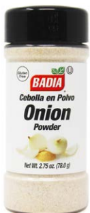
ONION POWDER - 80006 8/2.75 OZ