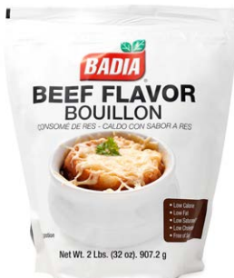
BEEF FLAVOR BOUILLON - 00095 8/2 LBS