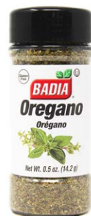
OREGANO - 80009 8/0.5 OZ