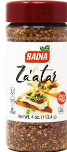
ZA'ATAR - 60090 6/4 OZ