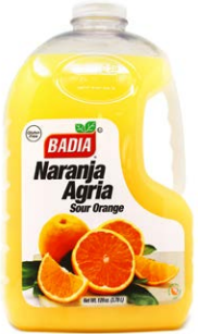
SOUR ORANGE - 00739 4/128 FL OZ