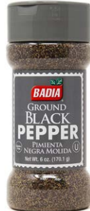
PEPPER BLACK GROUND - 01231 12/6 OZ