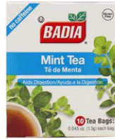
MINT TEA - 00624 20/10 BAGS