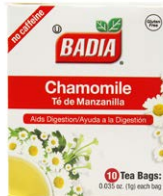
CHAMOMILE TEA - 00210 20/10 BAGS