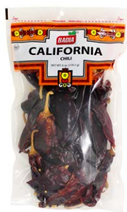
CALIFORNIA CHILI - 00684 12/6 OZ