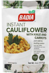
INSTANT CAULIFLOWER WITH KALE & CARROTS - 01264 6/4 OZ