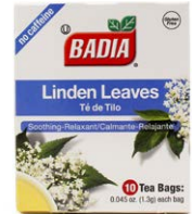
LINDEN LEAVES TEA - 00211 20/10 BAGS