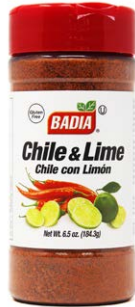
CHILE & LIME - 60156 6/6.5 OZ