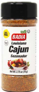
CAJUN LOUISIANA - 80691 8/2.75 OZ