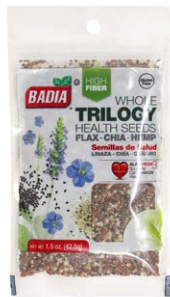
TRIOLOGY HEALTH SEEDS - 00080 12/1.5 OZ