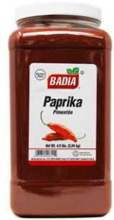
PAPRIKA - 00311 4/4.5 LBS