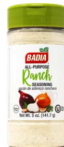
RANCH SEASONING - 61226 6/5 OZ

The one that started it all. The perfect combination of ingredients and spices, carefully chosen to enhance the natural flavor of your favorite food.