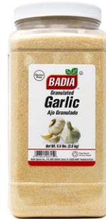
GARLIC GRANULATED - 00315 4/5.5 LBS