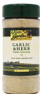
OLIVE GARDEN GARLIC & HERB ITALIAN SEASONING - 60292 6/4.5 OZ