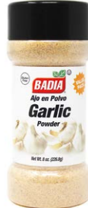
GARLIC POWDER - 01200 12/8 OZ