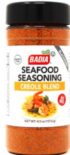
SEAFOOD SEASONING CREOLE BLEND - 60744 6/4.5 OZ