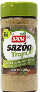
SAZÓN TROPICAL® - 60757 6/6.75 OZ