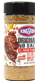
ORIGINAL NO SALT ALL-PURPOSE SEASONING - 66000