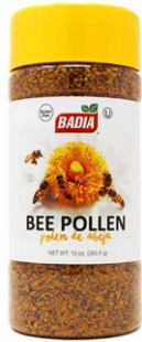
BEE POLLEN - 60125 6/10 OZ