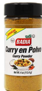
CURRY POWDER - 63007