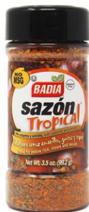
SAZÓN TROPICAL® WITH CORIANDER & ANNATTO - 80129 8/3.5 OZ