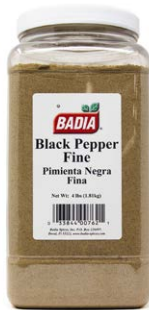
PEPPER BLACK GROUND FINE - 00762 4/4 LBS