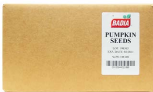
PUMPKIN SEEDS - 02086 1/10 LBS