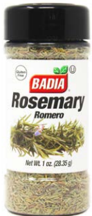
ROSEMARY - 80749 8/1 OZ