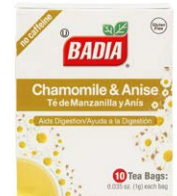
CHAMOMILE & ANISE TEA - 00225 20/10 BAGS