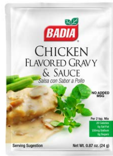
CHICKEN FLAVORED GRAVY - 00085 COMING SOON