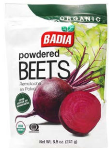
ORGANIC POWDERED BEETS - 02126 8/8.5 OZ