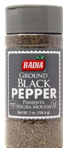
PEPPER BLACK GROUND - 00613 12/7 OZ