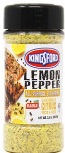
LEMON PEPPER ALL-PURPOSE SEASONING - 00180

A great mix of herbs and spices for all your needs in different sizes.