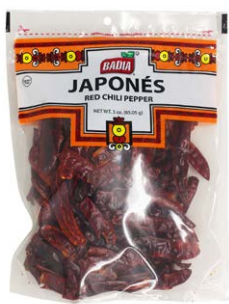
JAPONÉS (RED CHILI PEPPER) CHILI - 00067 12/3 OZ