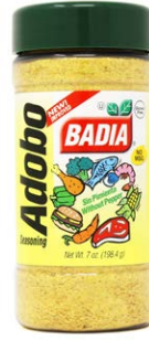
ADOBO WITHOUT PEPPER - 60401 6/7 OZ