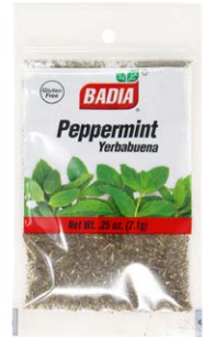
PEPPERMINT - 00059 12/0.25 OZ