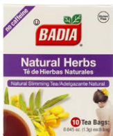
NATURAL HERBS TEA - 00631 20/10 BAGS