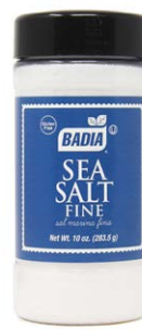
SEA SALT FINE - 60432 6/10 OZ