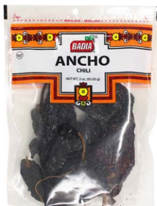
ANCHO CHILI - 00716 12/3 OZ

Browse our selection and find everything you need for a real Mexican meal.