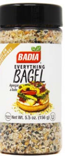
EVERYTHING BAGEL - 60096 6/5.5 OZ