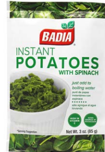
INSTANT POTATOES WITH SPINACH - 01266 6/3 OZ