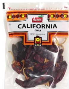
CALIFORNIA CHILI - 00642 12/3 OZ