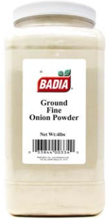
ONION GROUND FINE - 00334 4/4 LBS