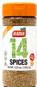
14 SPICES ALL-PURPOSE SEASONING - 60150 6/4.25 OZ