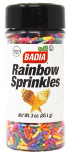
RAINBOW SPRINKLES - 80176 8/3 OZ