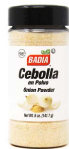
ONION POWDER - 63008