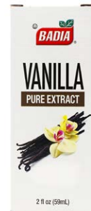
VANILLA EXTRACT - 00016 12/2 FL OZ