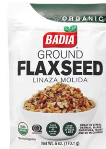
ORGANIC FLAX SEED GROUND - 01203 8/6 OZ