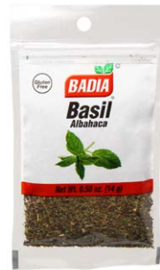
BASIL - 00072