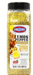
LEMON PEPPER ALL-PURPOSE SEASONING - 46007