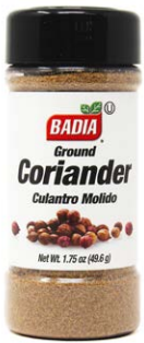
CORIANDER GROUND - 80203 8/1.75 OZ