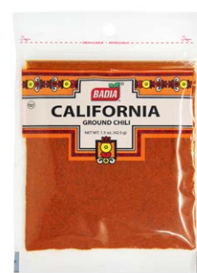
CALIFORNIA GROUND CHILI - 00647 12/1.5 OZ