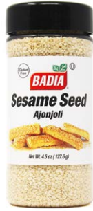
SESAME SEED - 60141 6/4.5 OZ