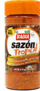
SAZÓN TROPICAL® WITH CORIANDER & ANNATTO - 60735 6/6.75 OZ