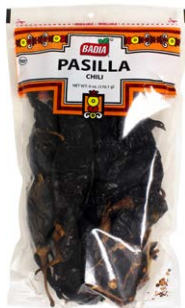
PASILLA (NEGRO LARGO) CHILI - 00685 12/6 OZ