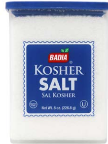
KOSHER SALT CAN - 00398 12/8 OZ