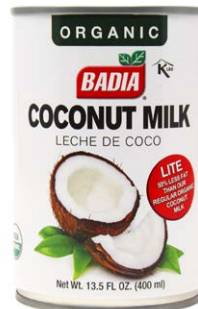
ORGANIC COCONUT MILK LITE - 00556 12/13.5 FL OZ