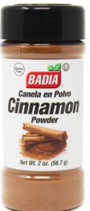
CINNAMON POWDER - 80015 8/2 OZ