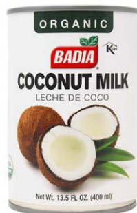
ORGANIC COCONUT MILK - 00555 12/13.5 FL OZ