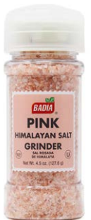
PINK HIMALAYAN SALT GRINDER - 80491 8/4.5 OZ