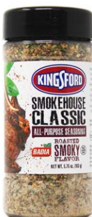
SMOKEHOUSE CLASSIC ALL-PURPOSE SEASONING - 66010