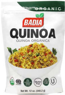
ORGANIC QUINOA - 00175 6/12 OZ