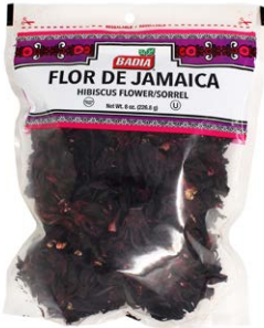
HIBISCUS FLOWER - 00644 12/8 OZ