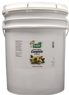
COMPLETE SEASONING® - 00702 35 LBS

Enjoy our favorites in a convenient size for your food preparations, from basics in the kitchen to our proprietary blends.