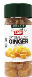
ORGANIC CRYSTALLIZED GINGER - 00126 12/10 OZ