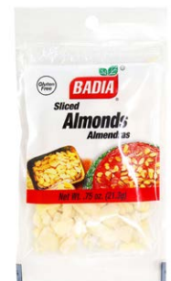
ALMONDS SLICED - 00036