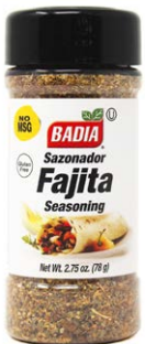
FAJITA SEASONING - 80634 8/2.75 OZ