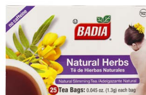
NATURAL HERBS TEA - 00792 10/25 BAGS