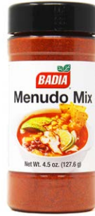
MENUDO MIX - 60753 6/4.5 OZ