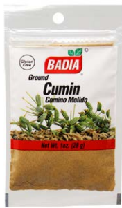
CUMIN GROUND - 00017 12/1 OZ