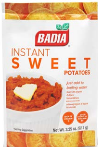
INSTANT SWEET POTATOES - 01267 6/3.25 OZ