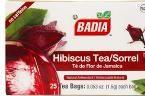
HIBISCUS TEA - 00628 10/25 BAGS