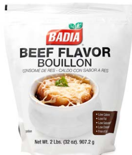
BEEF FLAVOR BOUILLON - 00095 8/2 LBS

The one that started it all, has the perfect combination of ingredients and spices, carefully chosen to enhance the natural flavor of your favorite food.