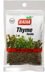
THYME LEAVES - 00209 12/0.5 OZ