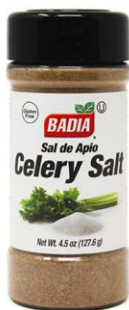
CELERY SALT - 80229 8/4.5 OZ