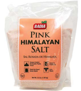
PINK HIMALAYAN SALT - 02130 8/3.5 LBS