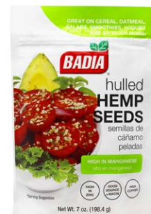
HULLED HEMP SEEDS - 01213 8/7 OZ