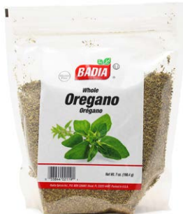
OREGANO - 02119 6/7 OZ