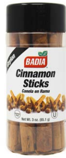
CINNAMON STICKS - 00318 12/3 OZ