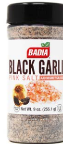
BLACK GARLIC PINK SALT - 60188 6/9 OZ