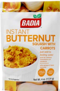
INSTANT BUTTERNUT SQUASH WITH CARROTS - 01262 6/4 OZ

Complement your everyday meals with these beautiful and tasty side dishes. From Instant Potatoes & Vegetables, to flavorful Bouillons and delicious Organic Quinoa.