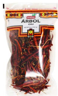
ÁRBOL CHILI - 00683 12/6 OZ