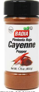
PEPPER CAYENNE GROUND - 80224 8/1.75 OZ