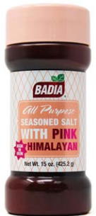
SEASONED SALT WITH PINK HIMALAYAN - 01220 12/15 OZ