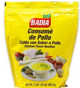
CHICKEN FLAVOR BOUILLON - 00934 8/2 LBS