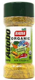
ADOBO ORGANIC - 01259 12/12.75 OZ