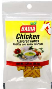
CHICKEN FLAVORED CUBES - 00077 12/1.25 OZ