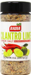
CILANTRO LIME PEPPER SALT - 60186 6/8 OZ