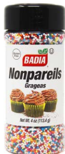
NONPAREILS - 80207 8/4 OZ