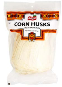
CORN HUSKS - 60645 6/6 OZ