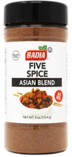
FIVE SPICE ASIAN BLEND - 60747 6/4 OZ