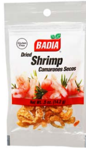
SHRIMP DRIED - 00038 12/0.5 OZ