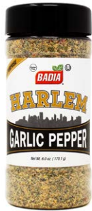
HARLEM GARLIC PEPPER - 60197 6/6 OZ