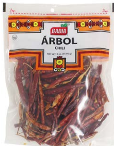
ÁRBOL CHILI - 00641 12/3 OZ