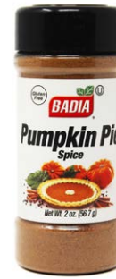
PUMPKIN PIE SPICE - 80204 8/2 OZ