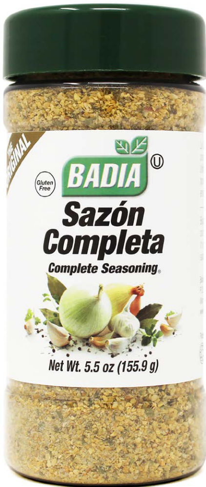
SAZÓN COMPLETA® - 63000