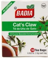
CAT'S CLAW TEA - 00712 20/10 BAGS

Our Tea Bags are filled with great attributes to improve health and well-being. From immune boosters, antioxidants, organics, natural slimming, to anti-inflammatory; Badia has one for you.