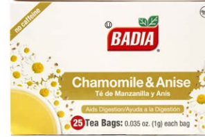
CHAMOMILE & ANISE TEA - 00793 10/25 BAGS