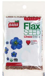
ORGANIC FLAX SEED - 00053 12/1.5 OZ