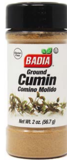
CUMIN GROUND - 80007 8/2 OZ