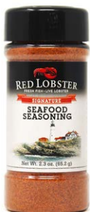
RED LOBSTER SEAFOOD SEASONING - 00093 12/2.3 OZ