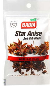
STAR ANISE - 00035 12/0.5 OZ