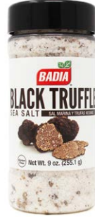
BLACK TRUFFLE SEA SALT - 60559 6/9 OZ