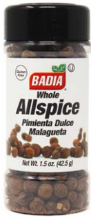
ALLSPICE - 80227 8/1.5 OZ