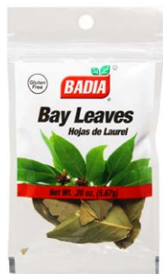
BAY LEAVES - 00019