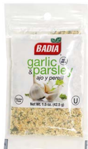
GARLIC & PARSLEY - 00076 12/1.5 OZ

Enjoy freely the incredible flavor of these great blends that are free of sodium!