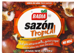
SAZON TROPICAL® WITH CORIANDER & ANNATTO - 00761 15/3.52 OZ