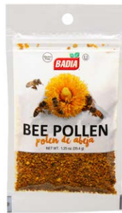
BEE POLLEN - 00082 12/1.25 OZ