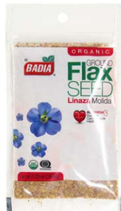
ORGANIC FLAX SEED GROUND - 00043 12/1.25 OZ