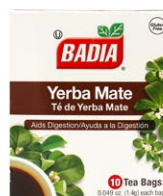
YERBA MATE TEA - 00768 20/10 BAGS