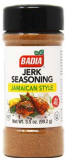
JERK SEASONING - 00187 12/3.5 OZ