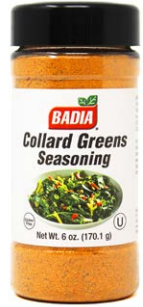
COLLARD GREENS SEASONING - 60557 6/6 OZ