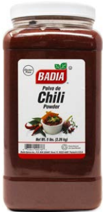
CHILI POWDER - 00278 4/5 LBS