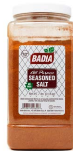
SEASONED SALT - 00600 4/7 LBS