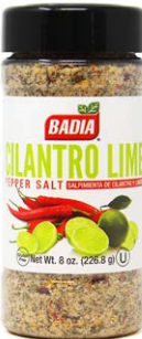
CILANTRO LIME PEPPER SALT - 60186 6/8 OZ