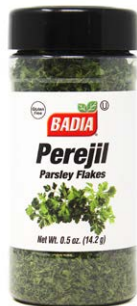
PARSLEY FLAKES - 63010