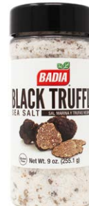
BLACK TRUFFLE SEA SALT - 60559 6/9 OZ