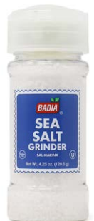
SEA SALT GRINDER - 80490 8/4.25 OZ