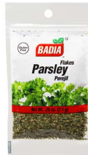
PARSLEY FLAKES - 00041 12/0.25 OZ