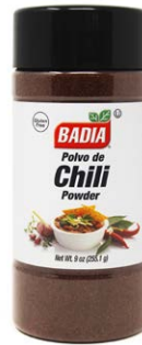
CHILI POWDER - 00214 12/9 OZ