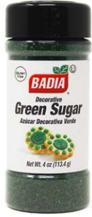
DECORATIVE GREEN SUGAR - 80267 8/4 OZ