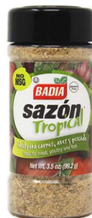
SAZÓN TROPICAL® - 80130 8/3.5 OZ