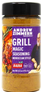
GRILL MAGIC SEASONING MOROCCAN SYTLE - 61301