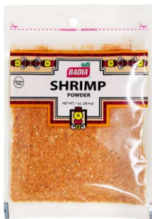
SHRIMP POWDER - 00286 12/1 OZ