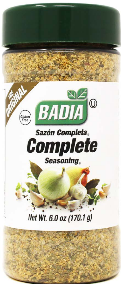
COMPLETE SEASONING® - 60135

Every blend is created with a perfect balance of flavor and with the highest quality spices and herbs.