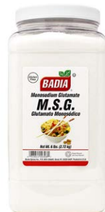
M.S.G. - 00308 4/6 LBS