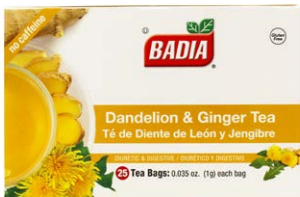
DANDELION & GINGER TEA - 00238 10/25 BAGS