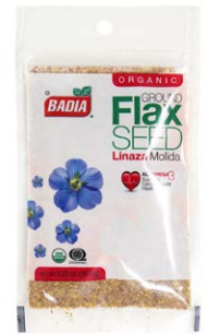
ORGANIC FLAX SEED GROUND - 00043 12/1.25 OZ