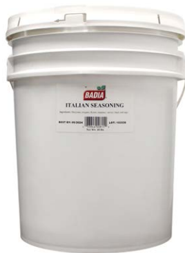
ITALIAN SEASONING - 00815 10 LBS