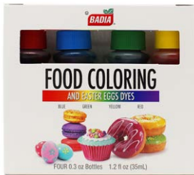
FOOD COLORING - 00422 12/1.2 FL OZ