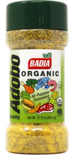
ADOBO ORGANIC - 01259 12/12.75 OZ