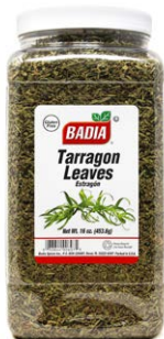
TARRAGON LEAVES - 00607 4/16 OZ