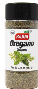
OREGANO WHOLE - 00103 12/2.25 OZ