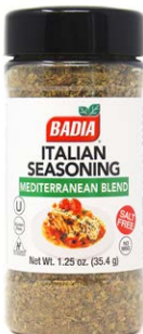
ITALIAN SEASONING MEDITERRANEAN BLEND - 60742 6/1.25 OZ