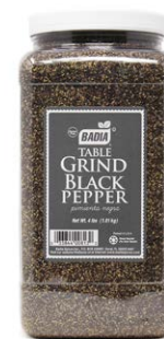
PEPPER BLACK TABLEGRIND - 00813 4/4 LBS