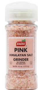
PINK HIMALAYAN SALT GRINDER - 80491