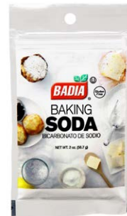
BAKING SODA - 00087