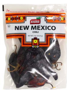
NEW MEXICO CHILI - 00640 12/3 OZ