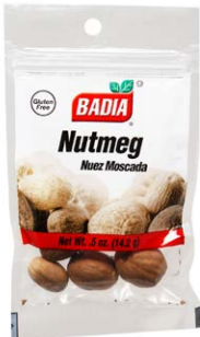
NUTMEG - 00031 12/0.5 OZ