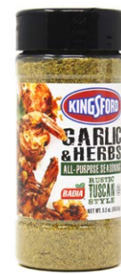
GARLIC & HERBS ALL-PURPOSE SEASONING - 66004