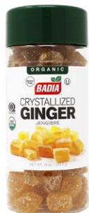
ORGANIC CRYSTALLIZED GINGER - 00126 12/10 OZ