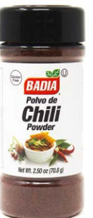
CHILI POWDER - 80201 8/2.5 OZ