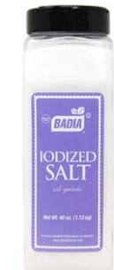
SALT IODIZED - 40508 4/40 OZ