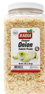
ONION FLAKES (CHOPPED) - 00568 4/3 LBS