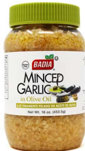
MINCED GARLIC IN OLIVE OIL - 00737 12/16 OZ