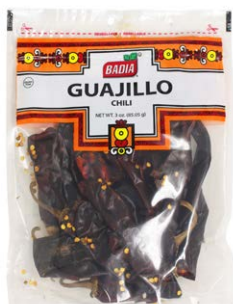
GUAJILLO CHILI - 00643 12/3 OZ