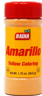
YELLOW COLORING - 80669 8/1.75 OZ