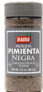
PEPPER BLACK GROUND - 63002