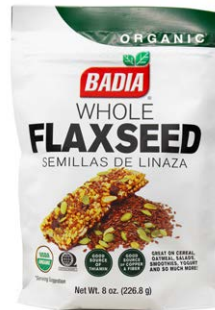
ORGANIC FLAX SEED - 01206 8/8 OZ