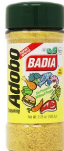
ADOBO WITHOUT PEPPER - 00132 12/3.75 OZ