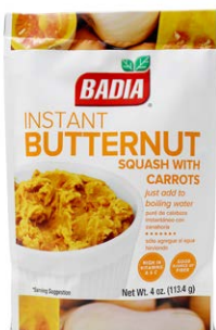
INSTANT BUTTERNUT SQUASH WITH CARROTS - 01262 6/4 OZ