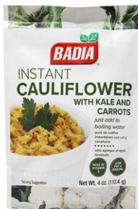
INSTANT CAULIFLOWER WITH KALE & CARROTS - 01264 6/4 OZ