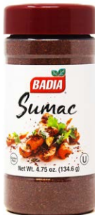
SUMAC - 60089 6/4.75