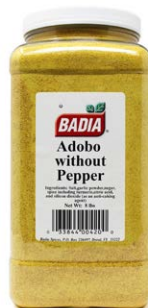
ADOBO WITHOUT PEPPER - 00420 4/8 LBS