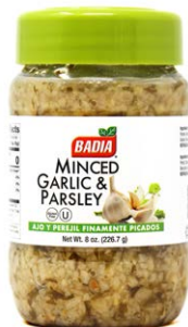
MINCED GARLIC & PARSLEY - 00234 12/8 OZ