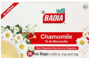
CHAMOMILE TEA - 00790 10/25 BAGS