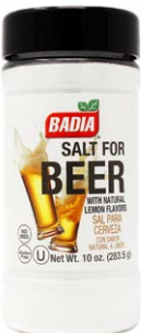
SALT FOR BEER - 60098 6/10 OZ