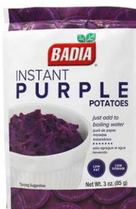
INSTANT PURPLE POTATOES - 01265 6/3 OZ