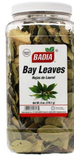
BAY LEAVES - 00313 4/6 OZ