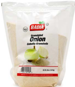
ONION GRANULATED - 02116 6/36 OZ