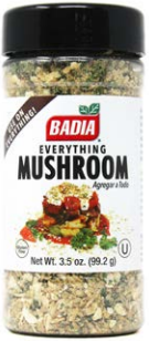
EVERYTHING MUSHROOM - 61227 6/3.5 OZ