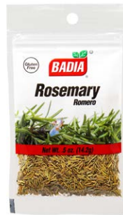
ROSEMARY - 00058 12/0.5 OZ