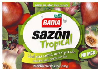
SAZON TROPICAL® - 00758 15/3.52 OZ