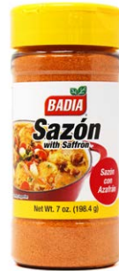
SAZÓN WITH SAFFRON - 60138 6/7 OZ