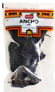
ANCHO CHILI - 00707 12/6 OZ