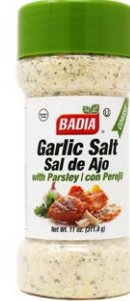
GARLIC SALT WITH PARSLEY - 01219 12/11 OZ