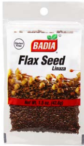
FLAX SEED - 00060 12/1.5 OZ