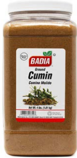
CUMIN GROUND - 00304 4/4 LBS