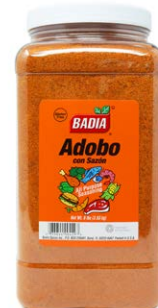
ADOBO WITH SAZÓN - 00429 4/8 LBS