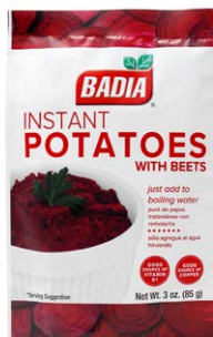
INSTANT POTATOES WITH BEETS - 01263 6/3 OZ