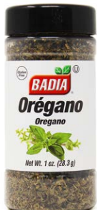
OREGANO - 63009