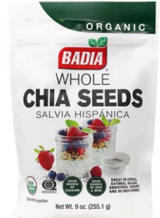
ORGANIC CHIA SEEDS - 01211 8/9 OZ