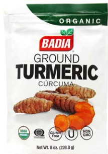
ORGANIC TURMERIC GROUND - 02129 8/8 OZ