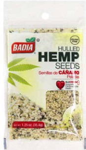
HULLED HEMP SEEDS - 00081 12/1.25 OZ