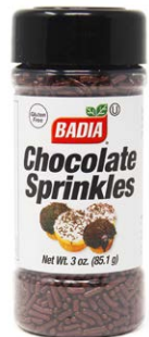
CHOCOLATE SPRINKLES - 80177 8/3 OZ