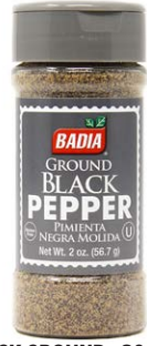
PEPPER BLACK GROUND - 80448 8/2 OZ