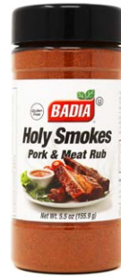
HOLY SMOKES PORK & MEAT RUB - 60392 6/5.5 OZ