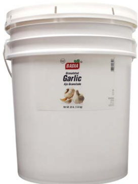
GARLIC GRANULATED - 00651 30 LBS