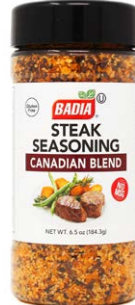
STEAK SEASONING CANADIAN BLEND - 60740 6/6.5 OZ