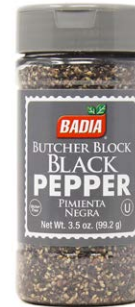
PEPPER BLACK BUTCHER BLOCK - 60495 6/3.5 OZ