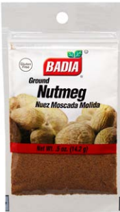
NUTMEG GROUND - 00032 12/0.5 OZ