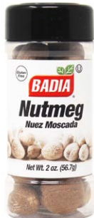
NUTMEG - 80750 8/2 OZ