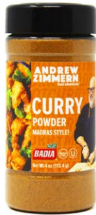
CURRY POWDER MADRAS STYLE - 61303