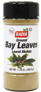
BAY LEAVES GROUND - 80013 8/1.75 OZ