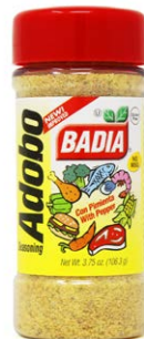
ADOBO WITH PEPPER - 00131 12/3.75 OZ