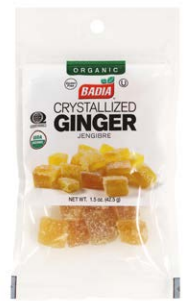
ORGANIC CRYSTALLIZED GINGER - 00083 12/1.5 OZ