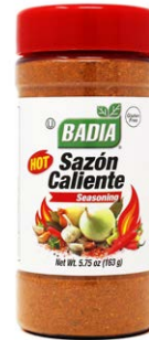
SAZÓN CALIENTE - 60393 6/5.75 OZ