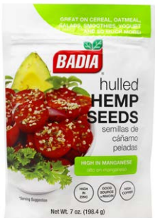
HULLED HEMP SEEDS - 01213 8/7 OZ