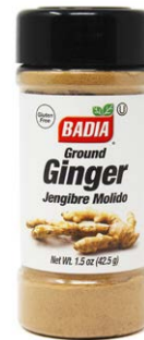
GINGER GROUND - 80223 8/1.5 OZ