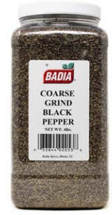
PEPPER BLACK COARSE GRIND - 02053 4/4 LBS