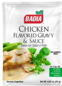
CHICKEN FLAVORED GRAVY - 00085 COMING SOON