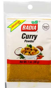
CURRY POWDER - 00074 12/1 OZ