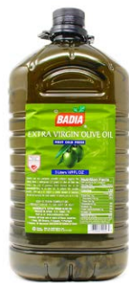
EXTRA VIRGIN OLIVE OIL - 00427 3/5 LITER