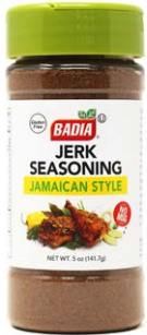
JERK SEASONING JAMAICAN STYLE - 60756 6/5 OZ