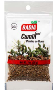
CUMIN SEED - 00018 12/1 OZ