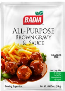
BROWN GRAVY - 00091 COMING SOON