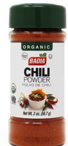
ORGANIC CHILI POWDER - 80171 8/2 OZ