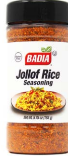
JOLLOF RICE SEASONING - 60199 6/5.75 OZ