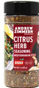
CITRUS HERB SEASONING MEDITERRANEAN STYLE - 61306