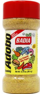
ADOBO WITH PEPPER - 01204 12/12.75 OZ