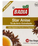
STAR ANISE TEA - 00629 20/10 BAGS