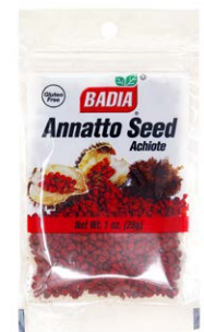
ANNATTO SEED - 00023