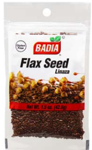
FLAX SEED - 00060 12/1.5 OZ