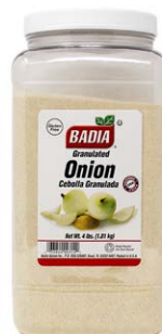
ONION GRANULATED - 00314 4/4 LBS