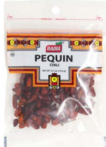
PEQUIN CHILI - 00654 12/0.5 OZ