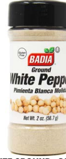
PEPPER WHITE GROUND - 80216 8/2 OZ