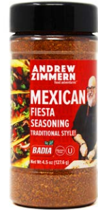
MEXICAN FIESTA SEASONING TRADITIONAL STYLE - 61300