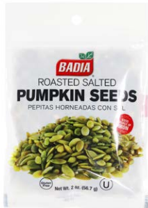
ROASTED SALTED PUMPKIN SEEDS - 00738 12/2 OZ

From basic ingredients as Cinnamon and Cardamom "Queen of Spices", to promoting a healthy lifestyle with our Trilogy Seeds. All your healthy and organic needs you'll find them here.