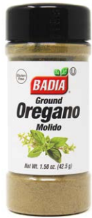
OREGANO GROUND - 80010 8/1.5 OZ