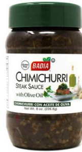
CHIMICHURRI SAUCE - 00405 12/8 OZ