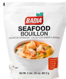
SEAFOOD BOUILLON - 00100 8/2 LBS