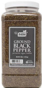
PEPPER BLACK GROUND - 00306 4/4 LBS