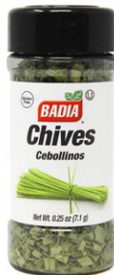
CHIVES - 80679 8/0.25 OZ