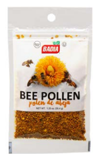
BEE POLLEN - 00082 12/1.25 OZ