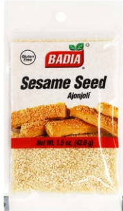
SESAME SEED HULLED - 00065 12/1.5 OZ