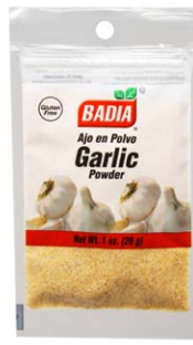
GARLIC POWDER - 00070 12/1 OZ