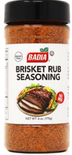
BRISKET RUB SEASONING - 60196 6/6 OZ