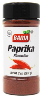
PAPRIKA - 80011 8/2 OZ