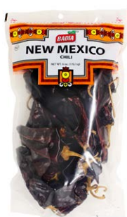
NEW MEXICO CHILI - 00686 12/6 OZ