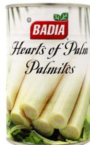
HEARTS OF PALM - 00449 12/14 OZ