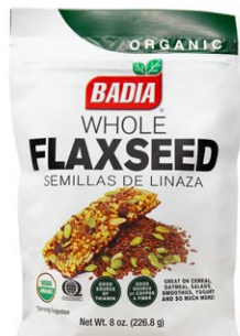
ORGANIC FLAX SEED - 01206 8/8 OZ