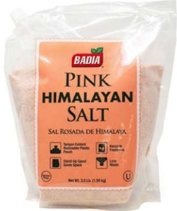
PINK HIMALAYAN SALT - 02130 8/3.5 LBS