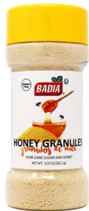
HONEY GRANULES - 00189 12/9.25 OZ