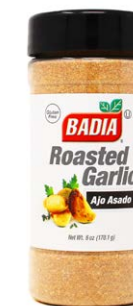
ROASTED GARLIC - 60390 6/5.5 OZ