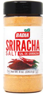
SRIRACHA SALT - 60151 6/8 OZ