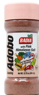
ADOBO WITH PINK HIMALAYAN SALT - 01225