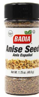
ANISE SEED - 80222 8/1.75 OZ