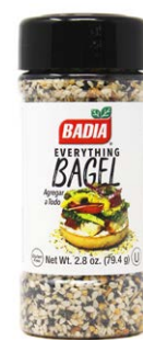
EVERYTHING BAGEL - 01244 8/2.8 OZ