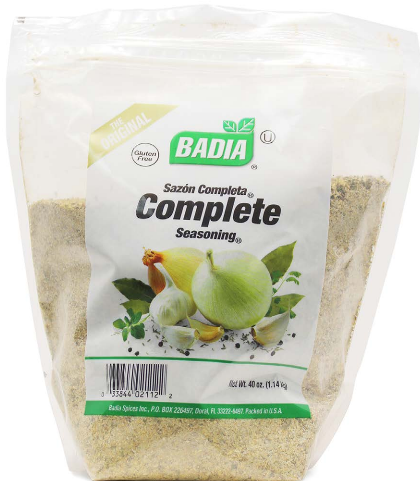
COMPLETE SEASONING® - 02112 6/40 OZ

Below you'll find a fine selection of key ingredients for your food preparations.