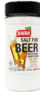
SALT FOR BEER - 60098 6/10 OZ