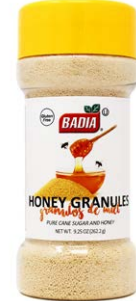
HONEY GRANULES - 00189 12/9.25 OZ