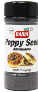
POPPY SEED - 80676 8/2.5 OZ