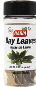
BAY LEAVES - 80208 8/0.17 OZ