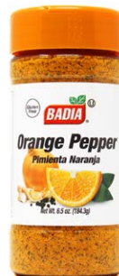
ORANGE PEPPER - 60194 6/6.5 OZ