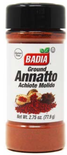
ANNATTO GROUND - 80012 8/2.75 OZ