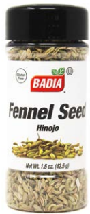
FENNEL SEED - 80671 8/1.5 OZ