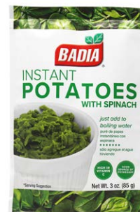
INSTANT POTATOES WITH SPINACH - 01266 6/3 OZ