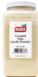
GARLIC GROUND FINE - 00333 4/4 LBS