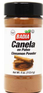
CINNAMON POWDER - 63003