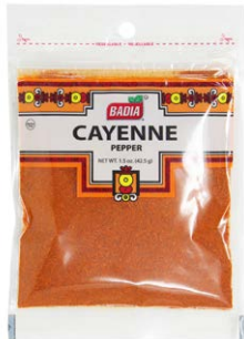
CAYENNE PEPPER GROUND - 00280 12/1.5 OZ