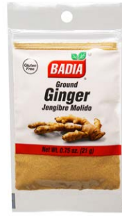
GINGER GROUND - 00075 12/0.75 OZ