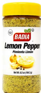
LEMON PEPPER - 60670 6/6.5 OZ