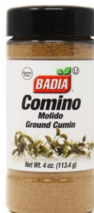
CUMIN GROUND - 63004