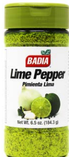
LIME PEPPER - 60655 6/6.5 OZ