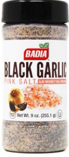
BLACK GARLIC PINK SALT - 60188 6/9 OZ