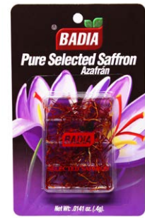
SAFFRON SPANISH - 00055 12/0.4 GM