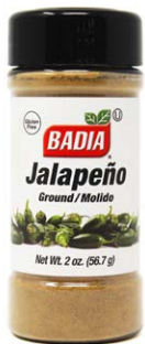
JALAPEÑO GROUND - 80752 8/2 OZ