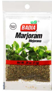
MARJORAM - 00057 12/0.25 OZ