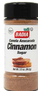
CINNAMON SUGAR - 80202 8/3.5 OZ