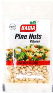
PINE NUTS - 00068 12/1 OZ