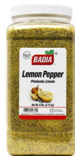
LEMON PEPPER - 00764 4/6 LBS