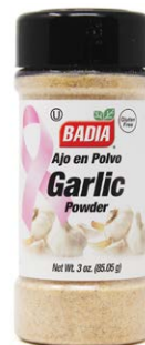
GARLIC POWDER - 80005 8/3 OZ