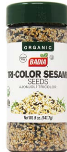
ORGANIC TRI-COLOR SESAME SEEDS - 60148 6/5 OZ