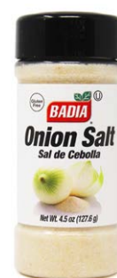
ONION SALT - 80730 8/4.5 OZ