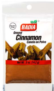
CINNAMON POWDER - 00030 12/0.5 OZ