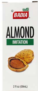
ALMOND EXTRACT - 00418 12/2 FL OZ