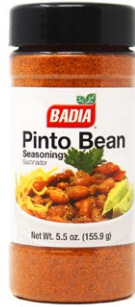
PINTO BEAN SEASONING - 60754 6/5.5 OZ