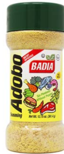
ADOBO WITHOUT PEPPER - 01205 12/12.75 OZ