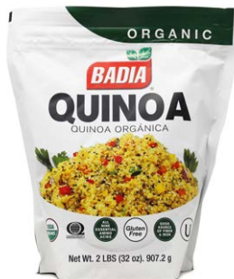
ORGANIC QUINOA - 00094 6/2 LBS